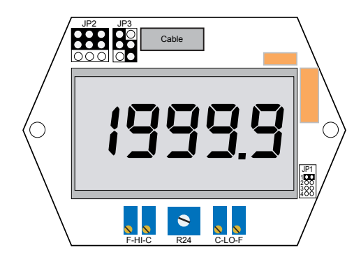
Figure 3. Display Board Balance Potentiometer (R24) is preset at the factory