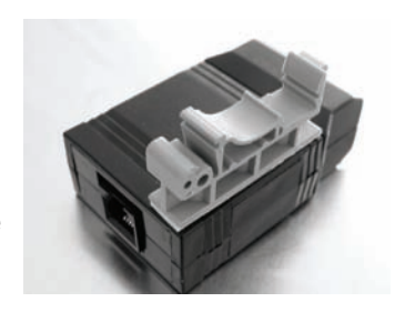
Communications Module Example

Peel the protective layer off of the adhesive tape on the bottom of one of the mounting clips. With the hinge end of the clip (see below) facing the end of the module with the communications connector, align the clip along the long (side) edge of the module and centered lengthwise within the flat surface of the module.