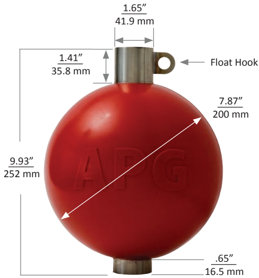
Float F - Polyurethane with 316L Stem (0.44 SG)