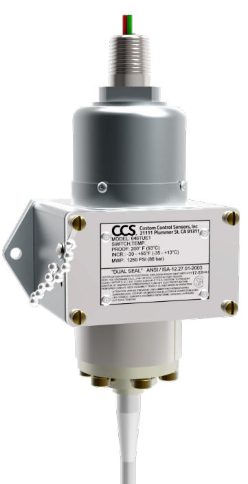
Capillary not shown.