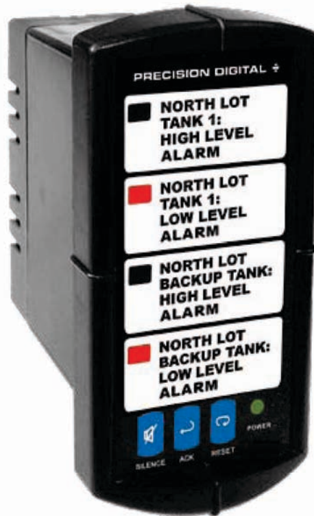
Model PD154 / 4-Point