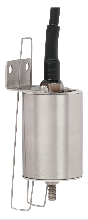
Bilge float switch with test device, model RLS-5000