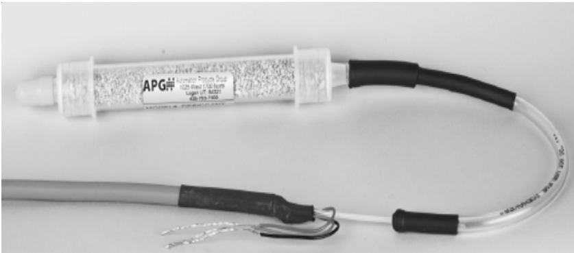
Desiccant Drying Cartridge with vent tube adapter attached to vented cable

Note: Replacement of the desiccant cartridge is recommended when the desiccant crystals have turned from blue to pink.